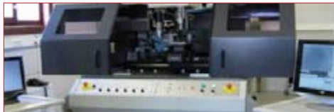
Excimer workstation with twin beam delivery