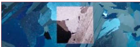
Removal of SiN layer from silicon wafer