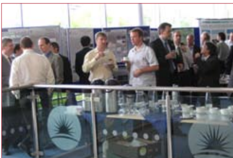
Lunchtime exhibition at a recent AILU workshop