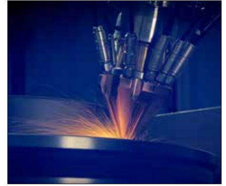
Cover image: EHLA coating applied to an automotive brake disc.